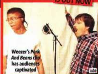
Weezer's Pork And Beans clip has audiences captivated

your wives and children? Actually, they come on tour with us, so we don't have to miss them at all. We've got special cribs built into the bunks on our tour bus and the kids come along and it's just one big happy family. Although touring isn't exactly as rock'n'roll as it used to be. [Laughs.]