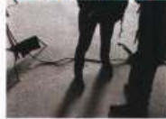
BECK MODERN GUILT